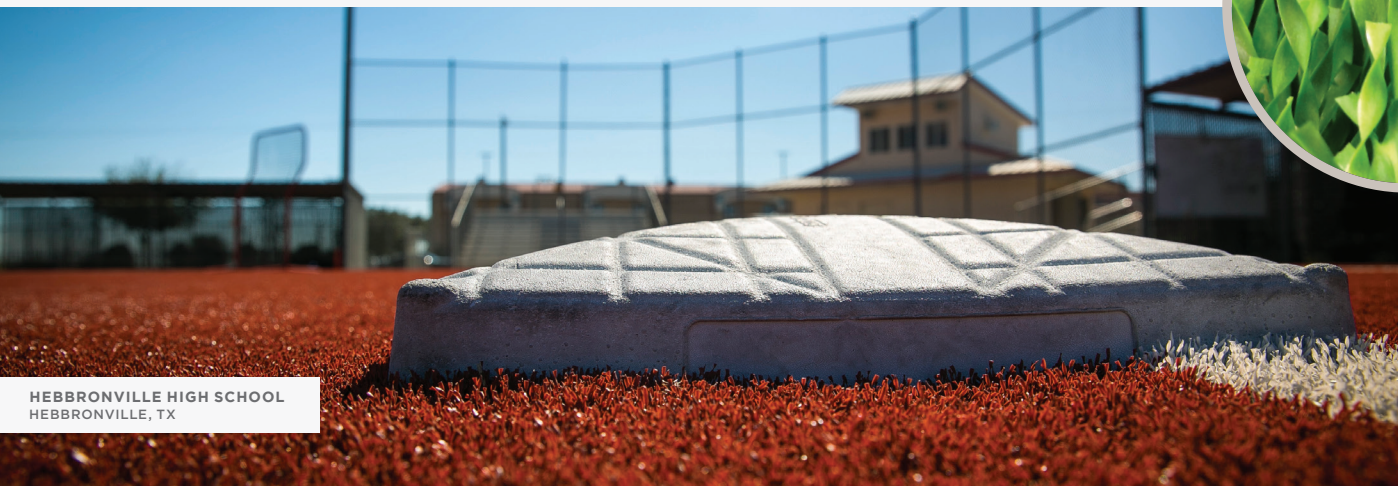
HEBBRONVILLE HIGH SCHOOL HEBBRONVILLE, TX

Major Play® Matrix® Helix is the unmatched synthetic turf system created specifically for baseball and softball. This system is designed to create advantages specific to baseball and softball. Major Play Matrix Helix delivers consistent and predictable ball response, a shock-absorbent field of play, and a long-lasting investment. Helix Technology adds memory and strength to fibers, allowing the fibers to spring back quickly after use.