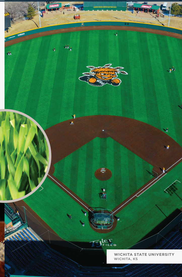
WICHITA STATE UNIVERSITY WICHITA, KS